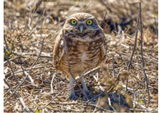
(Burrowing Owl)

The proposed quarry and processing plant represents a major intrusion into an otherwise relatively pristine area. Juristac's grasslands, oak woodland, riparian corridors, freshwater ponds and streams provide important habitat for an abundance of species. The project would eliminate approximately 248 acres of grassland habitat important for the California tiger salamander and California red-legged frog, both federally-listed threatened species, while also degrading breeding habitat in ponds adjacent to quarry operations. Birds of prey that forage in the area such as the Golden Eagle, Northern Harrier, Prairie Falcon and Burrowing Owl would also be impacted. Quarrying would destroy approximately 33 acres of California live oak woodland, a valuable roosting and foraging habitat for many native species.