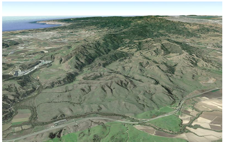
(Google satellite image of intact Juristac site)

Juristac (Huris-tak) lies at the heart of the ancestral lands of the Amah Mutsun Tribal Band near Gilroy, California at the southern edge of Santa Clara County. For thousands of years, Mutsun ancestors lived and held sacred ceremonies at this location in the foothills of the Santa Cruz Mountains, above the confluence of the Pajaro and San Benito rivers. The cultural landscape encompassing Juristac is known today as the Sargent Ranch.