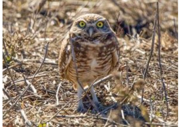
(Burrowing Owl)

The proposed quarry and processing plant represents a major intrusion into an otherwise relatively pristine area. Juristac's grasslands, oak woodland, riparian corridors, freshwater ponds and streams provide important habitat for an abundance of species. The project would eliminate approximately 248 acres of grassland habitat important for the California tiger salamander and California red-legged frog, both federally-listed threatened species, while also degrading breeding habitat in ponds adjacent to quarry operations. Birds of prey that forage in the area such as the Golden Eagle, Northern Harrier, Prairie Falcon and Burrowing Owl would also be impacted. Quarrying would destroy approximately 33 acres of California live oak woodland, a valuable roosting and foraging habitat for many native species.