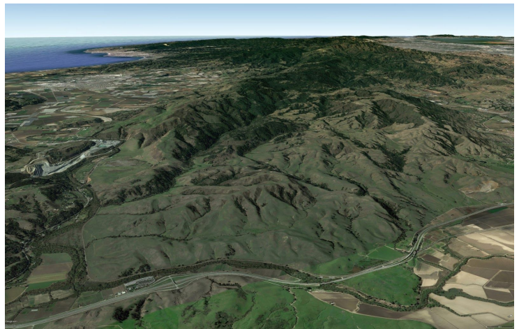
(Google satellite image of intact Juristac site)

Juristac (Huris-tak) lies at the heart of the ancestral lands of the Amah Mutsun Tribal Band near Gilroy, California at the southern edge of Santa Clara County. For thousands of years, Mutsun ancestors lived and held sacred ceremonies at this location in the foothills of the Santa Cruz Mountains, above the confluence of the Pajaro and San Benito rivers. The cultural landscape encompassing Juristac is known today as the Sargent Ranch.