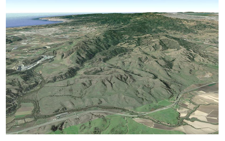
(Google satellite image of intact Juristac site)

Juristac (Huris-tak) lies at the heart of the ancestral lands of the Amah Mutsun Tribal Band near Gilroy, California at the southern edge of Santa Clara County. For thousands of years, Mutsun ancestors lived and held sacred ceremonies at this location in the foothills of the Santa Cruz Mountains, above the confluence of the Pajaro and San Benito rivers. The cultural landscape encompassing Juristac is known today as the Sargent Ranch.