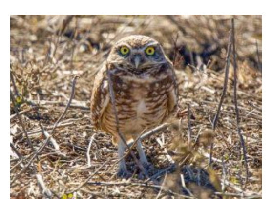
(Burrowing Owl photo: M. Damiani)

relatively pristine area. Juristac's grasslands, oak woodland, riparian corridors, freshwater ponds and streams provide important habitat for an abundance of species. The project would eliminate approximately 248 acres of grassland habitat important for the California tiger salamander and California red-legged frog, both federally-listed threatened species, while also degrading breeding habitat in ponds adjacent to quarry operations. Birds of prey that forage in the area such as the Golden Eagle, Northern Harrier, Prairie Falcon and Burrowing Owl would also be impacted. Quarrying would destroy approximately 33 acres of California live oak woodland, a valuable roosting and foraging habitat for many native species.