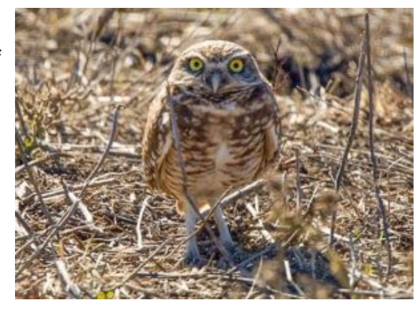
(Burrowing Owl)

relatively pristine area. Juristac's grasslands, oak woodland, riparian corridors, freshwater ponds and streams provide important habitat for an abundance of species. The project would eliminate approximately 248 acres of grassland habitat important for the California tiger salamander and California red-legged frog, both federally-listed threatened species, while also degrading breeding habitat in ponds adjacent to quarry operations. Birds of prey that forage in the area such as the Golden Eagle, Northern Harrier, Prairie Falcon and Burrowing Owl would also be impacted. Quarrying would destroy approximately 33 acres of California live oak woodland, a valuable roosting and foraging habitat for many native species.