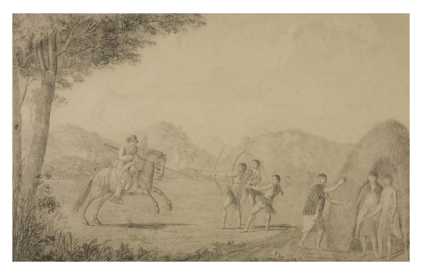
FIGURE 4. This drawing illustrates how Rumsen or Costanoan archers would defend their community from a charging Spanish dragoon. Tomás de Suria, "Modo de pelear de los Yndios de Californias [Mode of combat of the Indians of the Californias]," pencil drawing, 1791. Courtesy of Archivo del Museo Naval, Madrid, Spain.

In response to the rising number of escapees, the state supported increasingly violent recapture operations. In 1797, Spanish soldiers attacked a group of escapees and non-mission Indians, killing seven and capturing eighty-three. Three years later, Sergeant Pedro Amador killed a chief during a recapture and round-up operation. In 1804, Father Estevan Tapís reported, "fugitives are increasing and the only remedy is an immediate increase of military force. Others listened. In 1812, an expedition from missions San Francisco and San José attacked escapees and their allies, leaving many dead. In 1829, the Mexican soldier Joaquín Piña recorded how his unit attacked escaped California mission Indians, killing perhaps thirty or more people, including male and female prisoners. The following year, a Mission San Rafael priest ordered some escapees recaptured, enlisting the