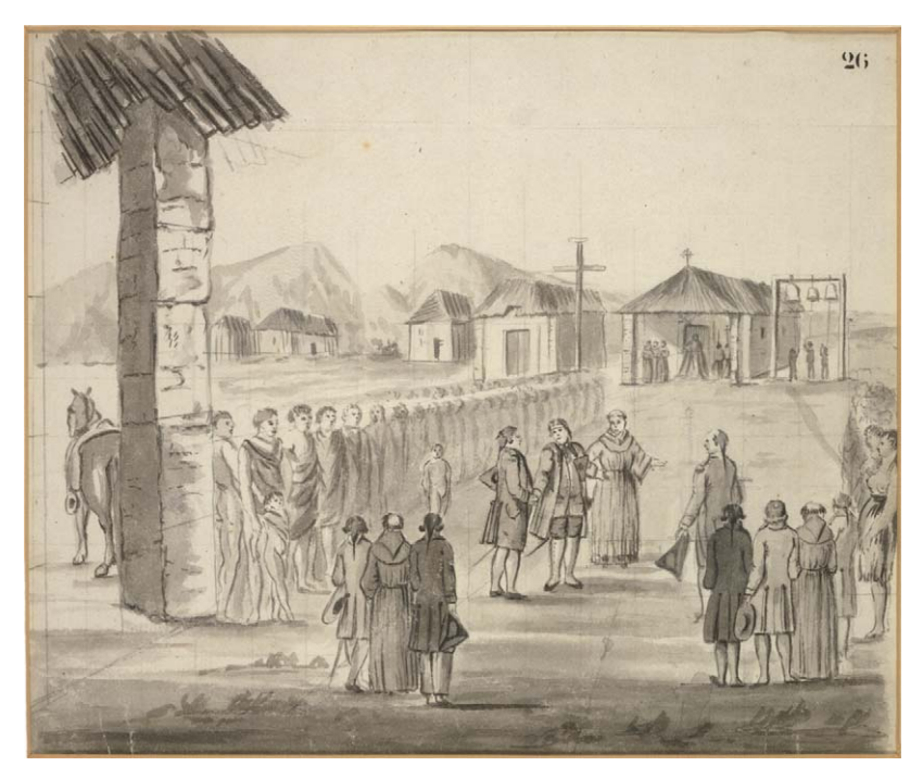
FIGURE 2. Count Jean François de la Pérouse, other visitors, and missionaries observe San Carlos Borroméo Mission Indians standing at attention during a formal inspection accompanied by bell ringing. José Cardero, "Copia de un dibujo que deja el Pintor del Conde dela Perouse a los Padres de la Mision del Carmelo en Monterey [Copy of a Drawing of the Visit of the Count de la Pérouse to the Fathers at the Mission of Carmel at Monterey (in 1786), California]," drawing on paper, [1791–1792]. Courtesy of the Bancroft Library, Berkeley, California.

from dawn to dusk. Like many jailors, Franciscans sometimes lined up California mission Indians for inspection, as depicted below in Figure 2.