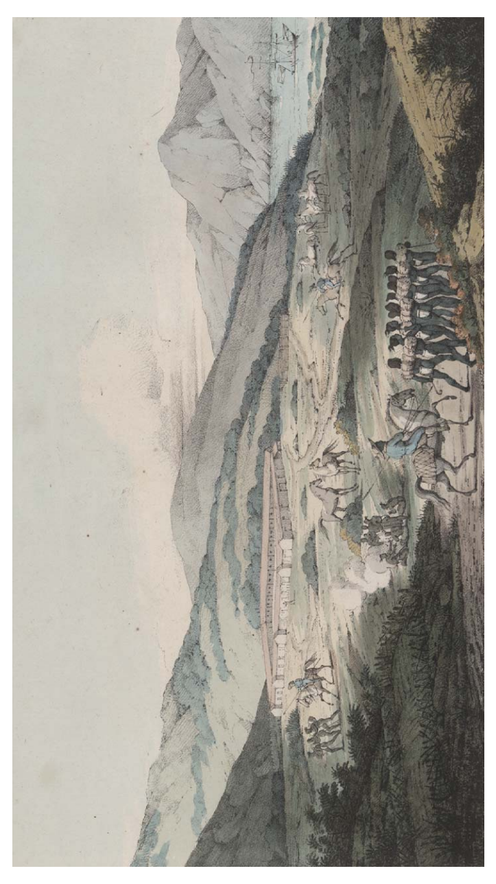
Presidio s." Francisco [View of San Francisco Presidio]," lithograph, c. 1815. FIGURE 3. In the foreground, a mounted overseer carrying a whip or lance marches ten California Indians north toward San Francisco Bay. To the left, another overseer on horseback drives three California Indians south. Louis Choris, "Vue du