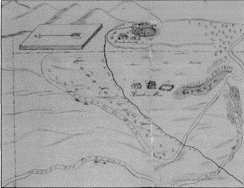
Diseño (ca. 1830) for the original Juristac (Rancho La Brea) land grant. Land Case Map D-307, Diseño for Rancho Juristac, ca. 1830, mss., Bancroft Library. The location of Rancho La Brea was the location of a Mutsun village.